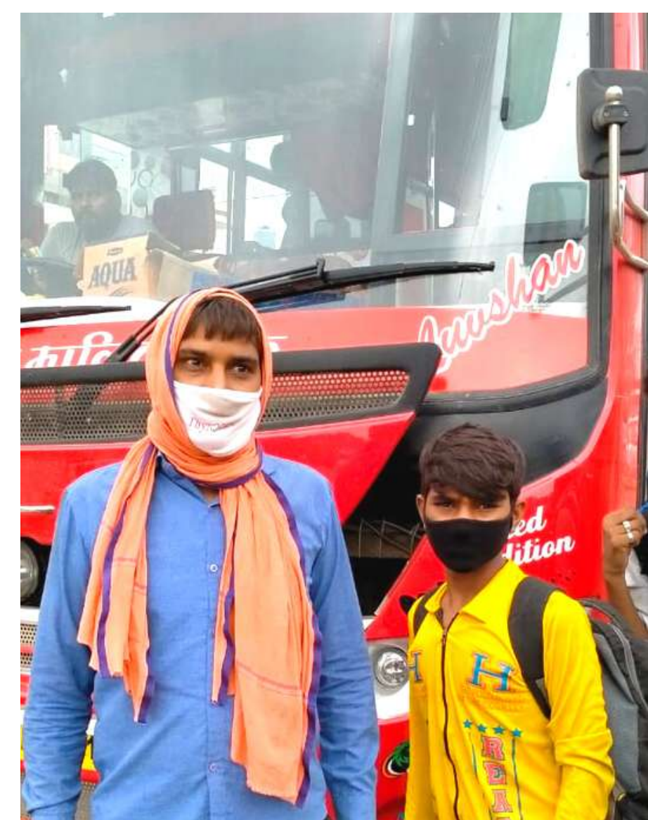
GET PEOPLE HOME